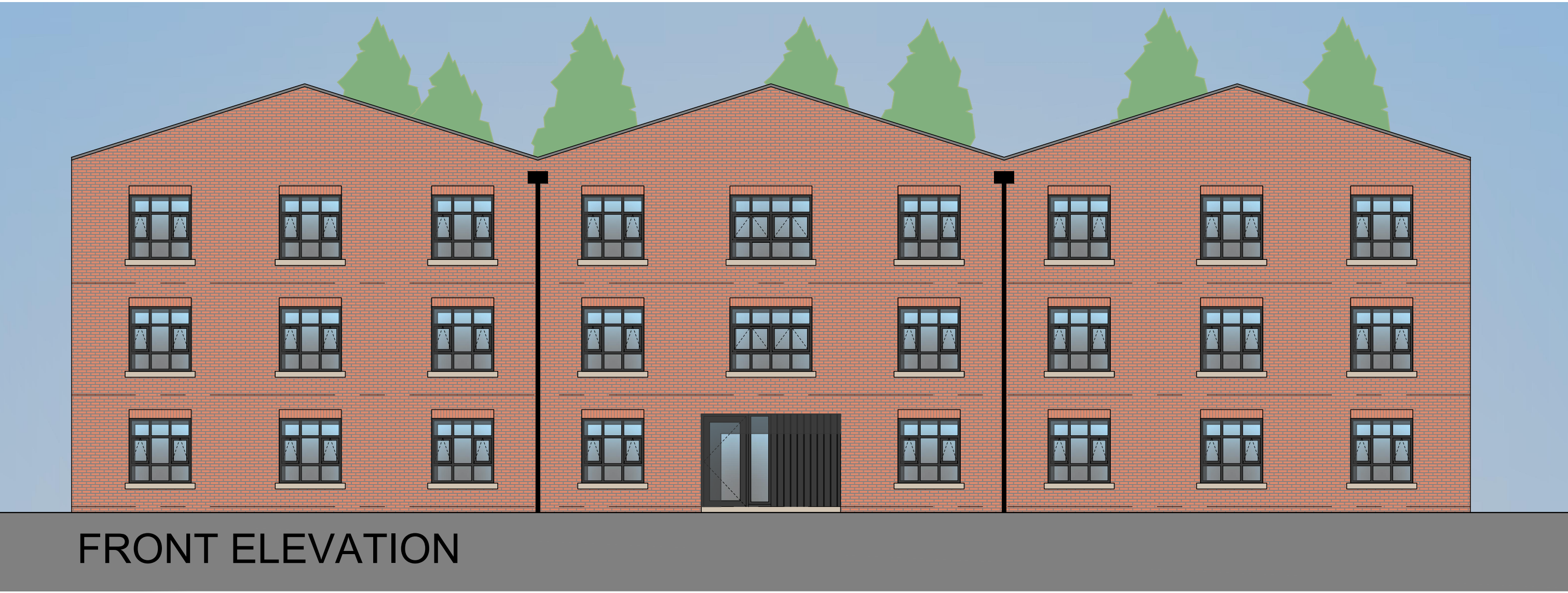
01 Proposed Front Elevation (East Elevation) 05 Scale 1:100 @ A1