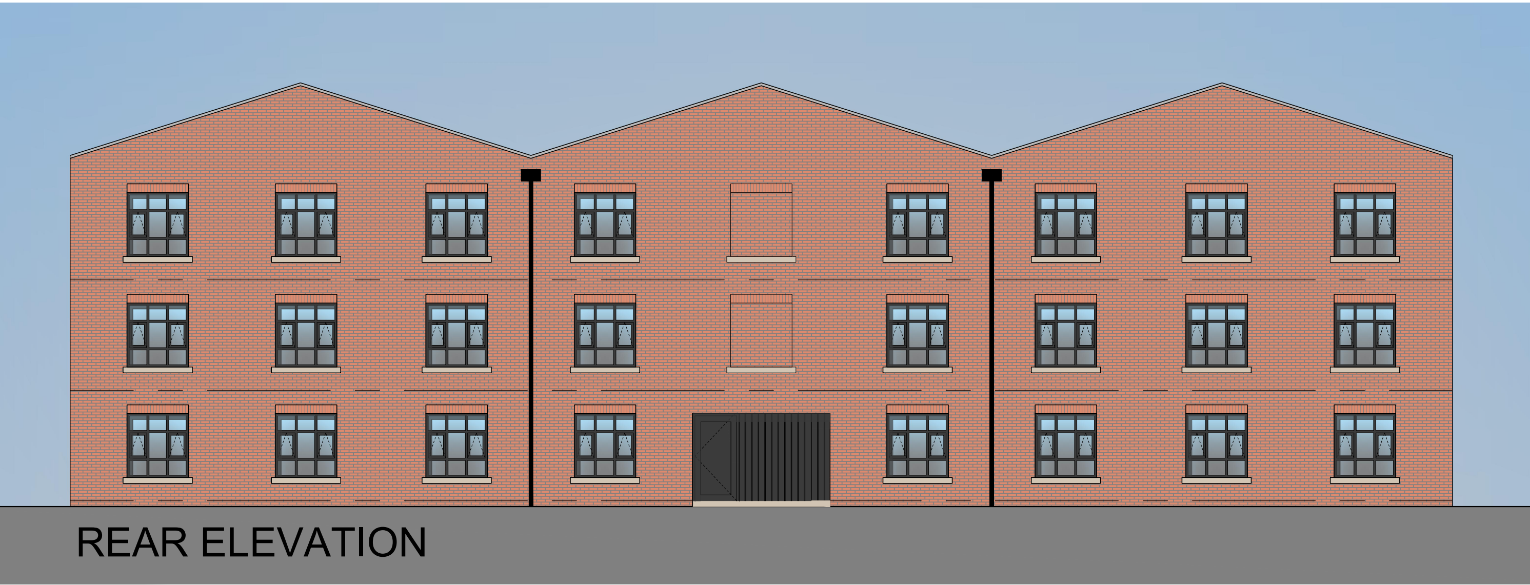
03 Proposed Rear Elevation (West Elevation) 04 Scale 1:100 @ A1

General Notes 01: Dimensions must not be scaled from this drawing. If in doubt, please ask. 02: All dimensions are in millimetres unless noted otherwise. 03: All dimensions should be verified on site before proceeding with the work. 04: TADW Architects shall be notified in writing of any discrepancies. 05: © TADW Limited (UK) 2015